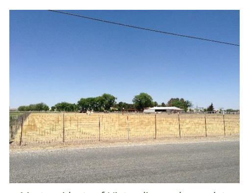
Most residents of Vinton live on large plots of land where many grow their own fruits or vegetables they trade with neighbors.

The Village of Vinton has a long term vision for growth focused on creating a new main street and mixed use development along Vinton Road. The Village also seeks to improve the quality of life for its residents by improving public health, supporting local job growth and improving the quality of housing. Building on these aspirations, the Village of Vinton has embarked on a number of new initiatives to expand the local food system including starting a farmers market, forming a community garden, initiating a small business incubator program, and developing an educational campaign to inform residents on the benefits of local foods, methods for improving home garden yields, and other entrepreneurial opportunities.