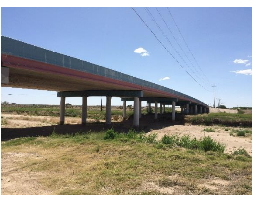
The Rio Grande is dry for most of the year except during the rainy season between June and August.

overflow the natural arroyos which carry water down from the adjacent Franklin Mountains through the village to the Rio Grande. Local residents refer to this phenomenon as "Anthony's nose is running," which is a local saying referring to heavy rain flowing over the prominent nose-like geological feature near the