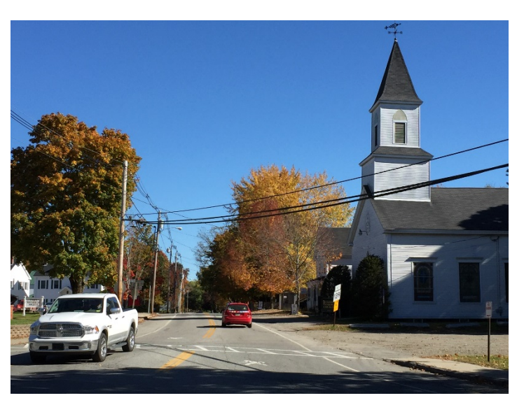
Corner of Main and Depot Street in Unity, Maine.

Well known as the home of the Maine Organic Farmers and Gardeners Association and its annual Common Ground Fair, Unity has maintained its stance as a strong agricultural center for the region. The town is home to Unity College, a private, liberal arts college located just a mile east of downtown. The college was founded in 1965, with just 15 faculty members and 39 students, as part of an initiative to offset the economic effects of the then-declining chicken farming industry. In the last few years, the school has seen an increase in its endowment and attendance is up due in part because of recent efforts to strengthen existing academic programs