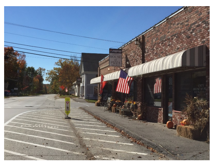
Local retail located at the corner of Main Street and School Street..

Like most historic towns in the United States, Unity was built around a traditional main street and rail line. The construction of interstate I-95 to the west of town drew many businesses and activity away from its historic center. Over the years, growth continued to respond to auto-centric patterns which allowed development to spread further out. Today, the larger downtown mixed use district stretches along Main Street, Depot Street and School Street. The commercial businesses, civic uses and retail areas are not contiguous and the boundaries of the district edges are located about a mile away from each other making it diffult to walk between