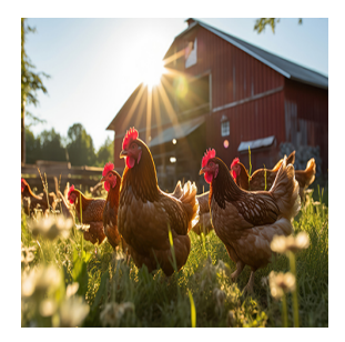
NOP-360: Organic Livestock and Poultry Standards (OLPS) Final Rule Core Course

final rule protects organic integrity and bolsters farmer and consumer confidence in the USDA organic seal by supporting strong organic control systems, improving farm to market traceability, increasing import oversight authority, and providing robust enforcement of the organic regulations. The SOE complements and supports the many actions that the USDA takes to protect the organic label, including the registration of the USDA organic seal trademark with the United States Patent and Trademark Office (USPTO). The registered trademark provides authority to deter uncertified entities from falsely using the seal, which—together with this new rule—provides additional layers of protection to the USDA organic seal. This course divides the rule's sections into nine manageable lessons for targeted reading and learning.