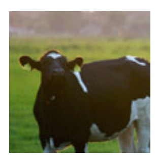
NOP-330: Origin of Livestock

The Conducting Yield Analysis course provides instruction on how to complete and evaluate a yield analysis for U.S.- and non-U.S.-based operations. It introduces the concepts and research that underpin yield analysis. It then teaches how to apply these concepts through hands-on exercises. The course explains potential outcomes of yield analysis and provides a framework for evaluating results, with a discussion of caveats and considerations. Finally, the course recommends best practices for documenting yield analysis, which is essential when determining a course of action for operations that may have violated the organic regulations.