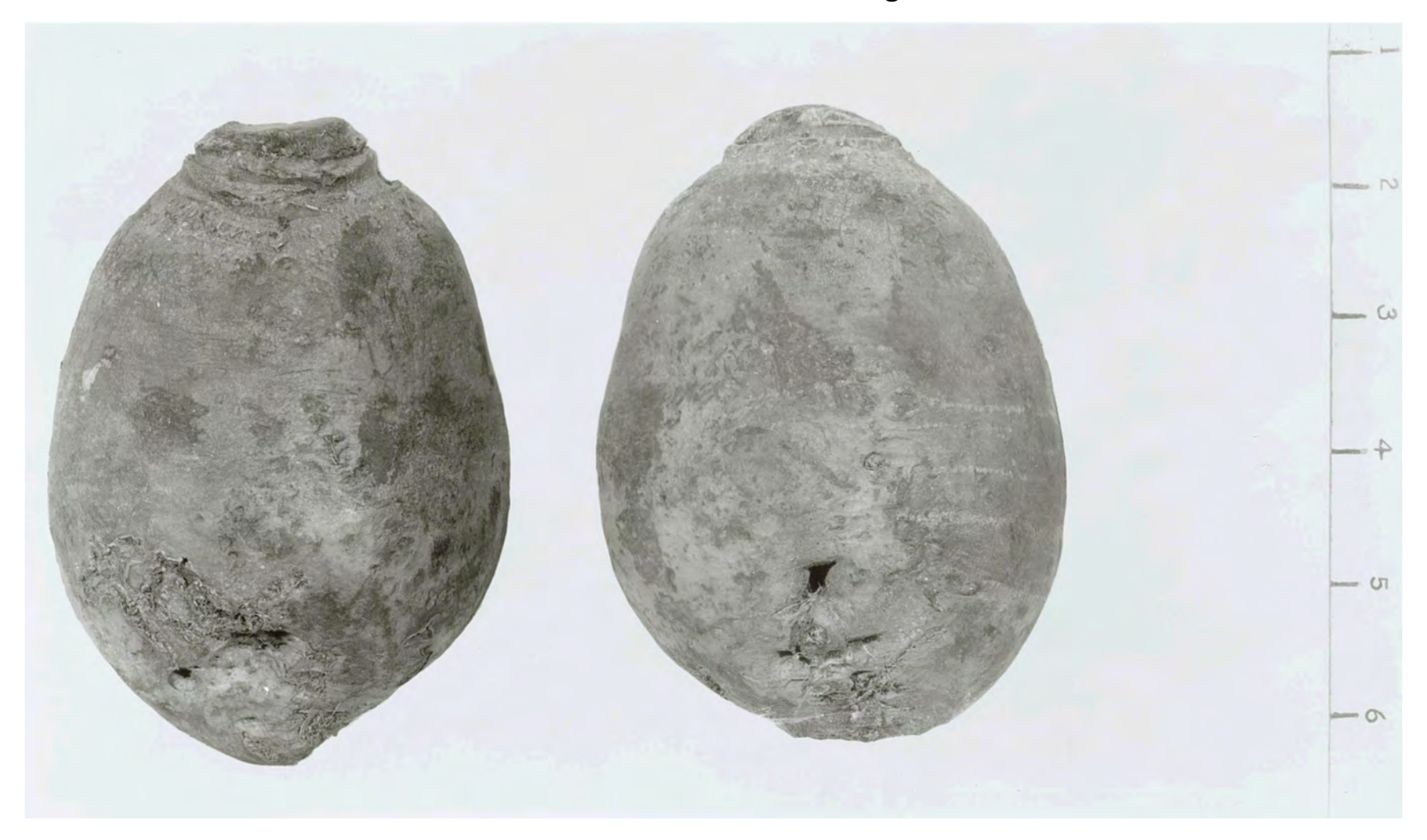
U.S. No. 1 for shape. May be out on waste.

Turnips/Rutabagas, Photo No. 2 January 1991 (Previously No. 2, no date)