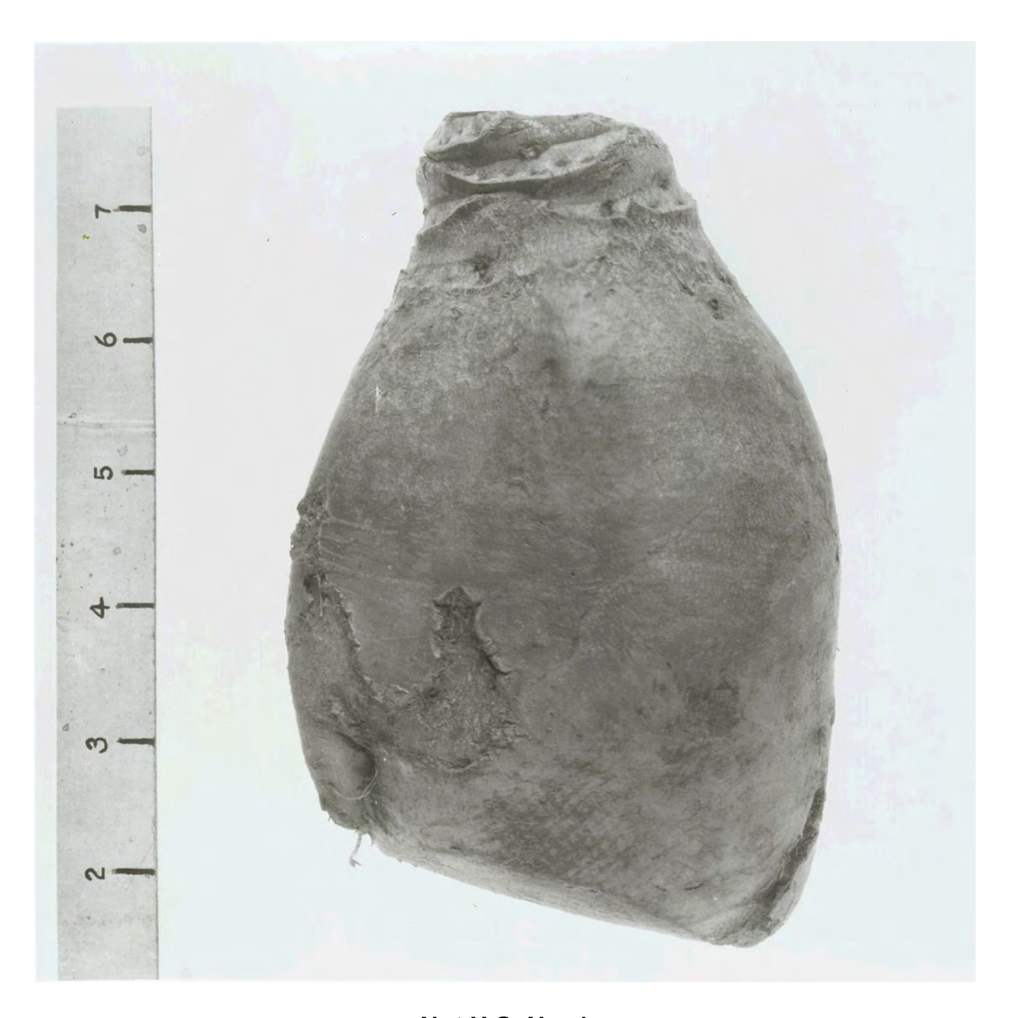
Not U.S. No. 1

Turnips/Rutabagas, Photo No. 1 January 1991 (Previously No. 1, no date)