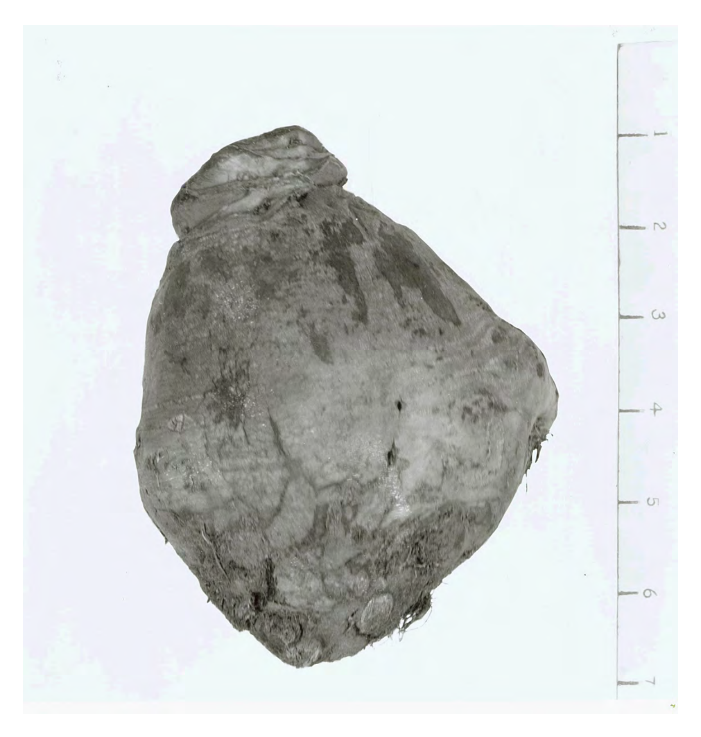
Not U.S. No. 1

Turnips/Rutabagas, Photo No. 7 January 1991 (Previously No. 7, no date)