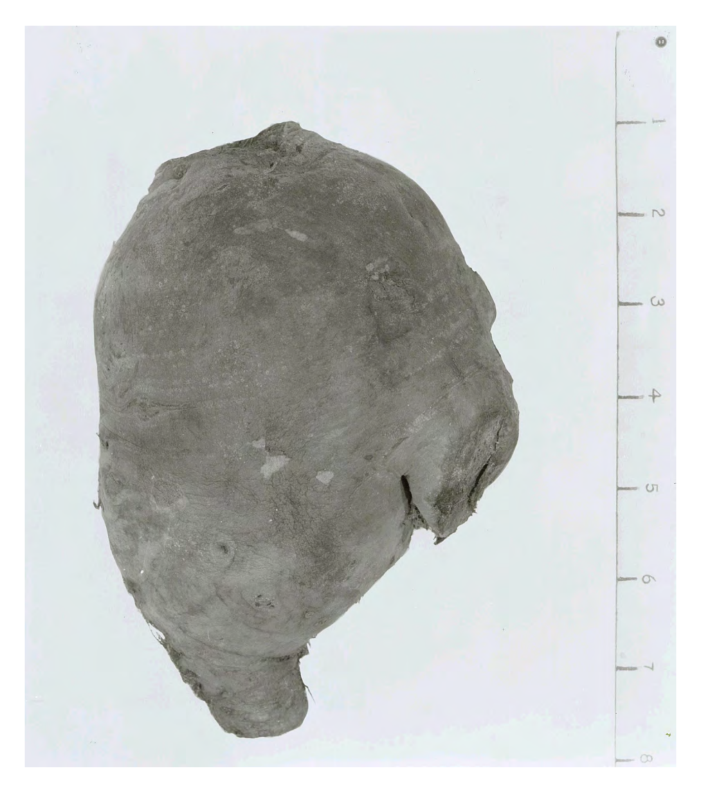
Not U.S. No. 1

Turnips/Rutabagas, Photo No. 8 January 1991 (Previously No. 8, no date)