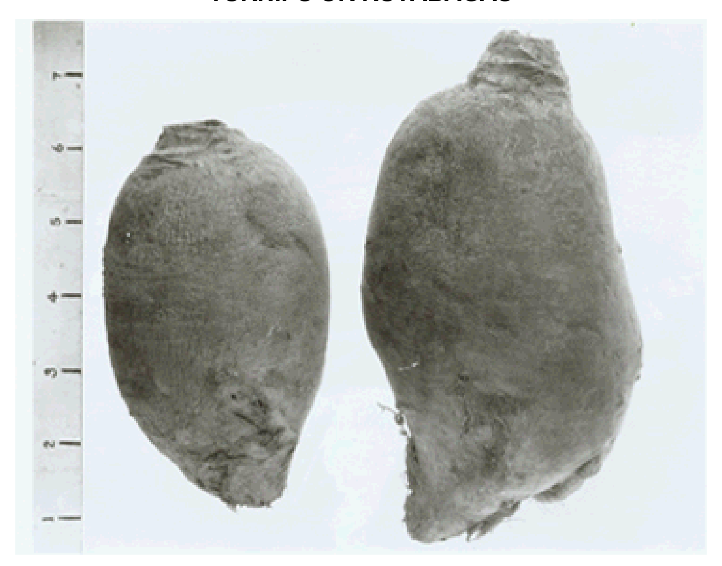
U.S. No. 1