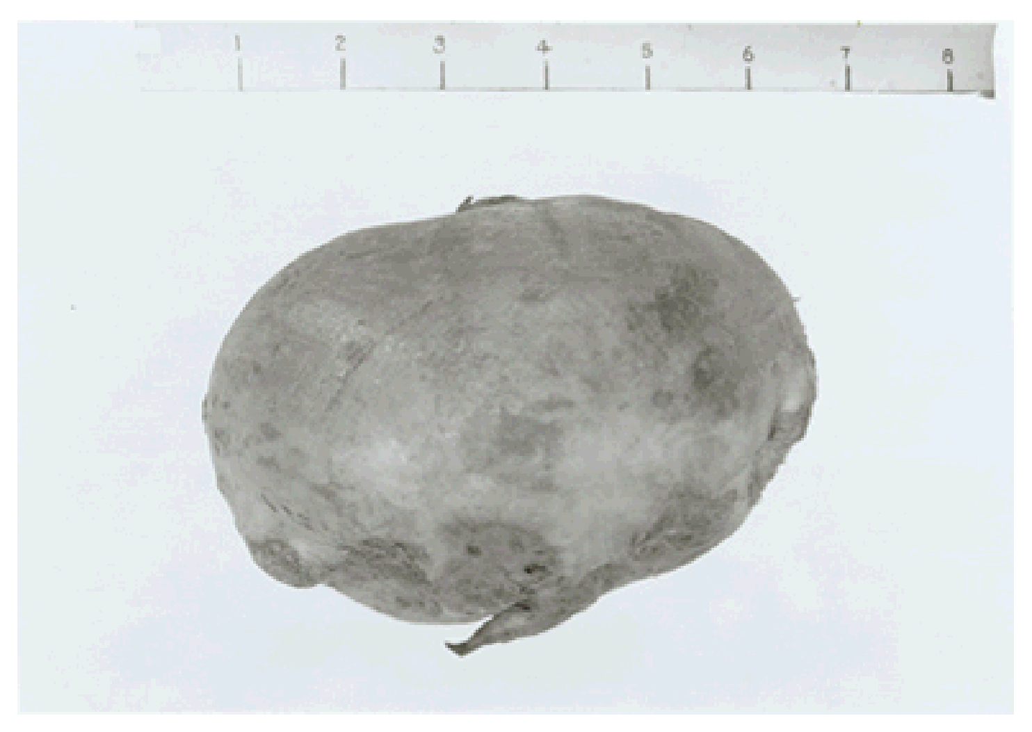
U.S. No. 1 for shape. If very rough on bottom, score against grade.

Turnips/Rutabagas, January 1991 (Previously No. 9, no date)