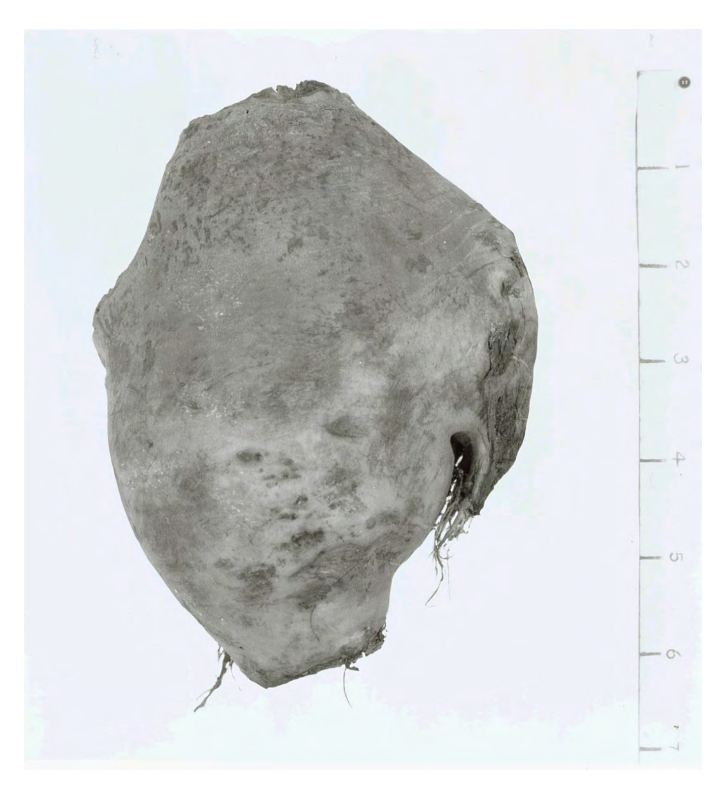
Not U.S. No. 1

Turnips/Rutabagas, Photo No. 5 January 1991 (Previously No. 5, no date)