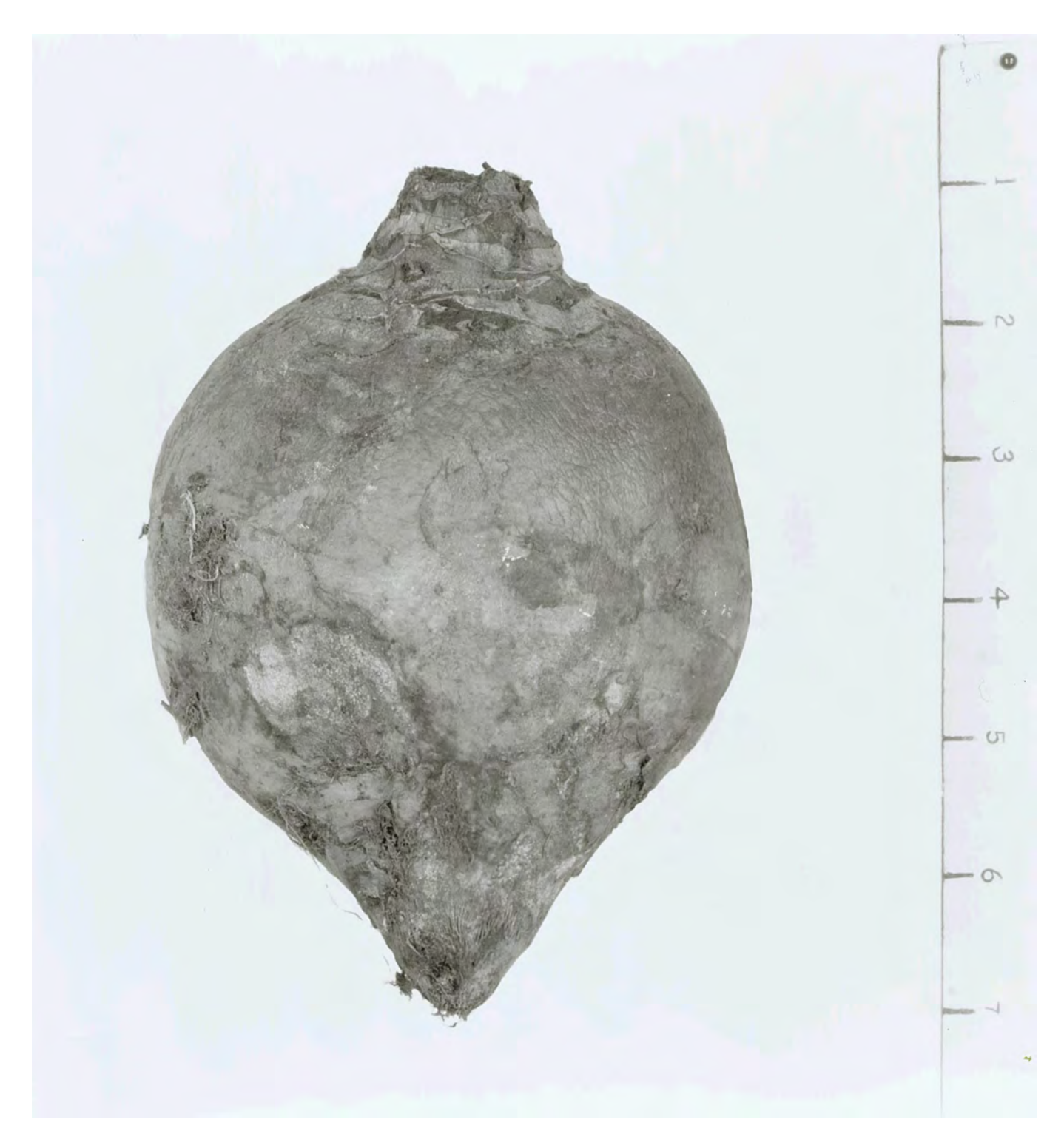
U.S. No. 1 for shape. May be out on waste.

Turnips/Rutabagas, Photo No. 4 January 1991 (Previously No. 4, no date)