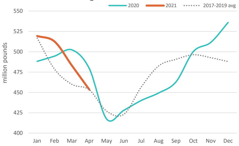
Table-Egg Layers on Hand 1st of Month