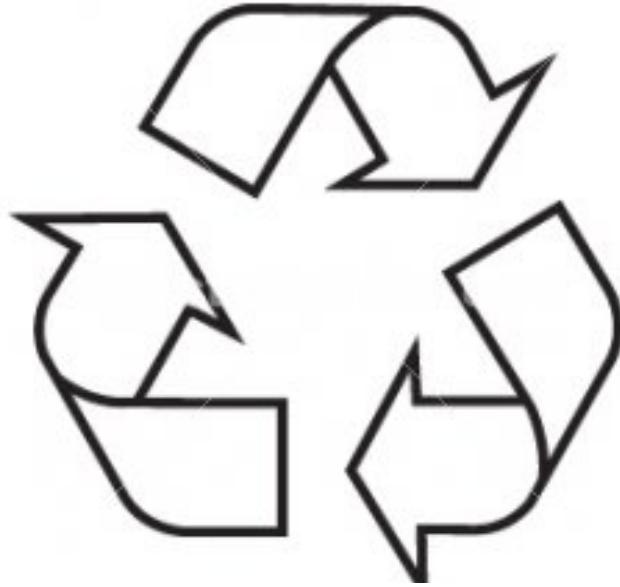
EXHIBIT 3 “Please Recycle” Symbol and Statement