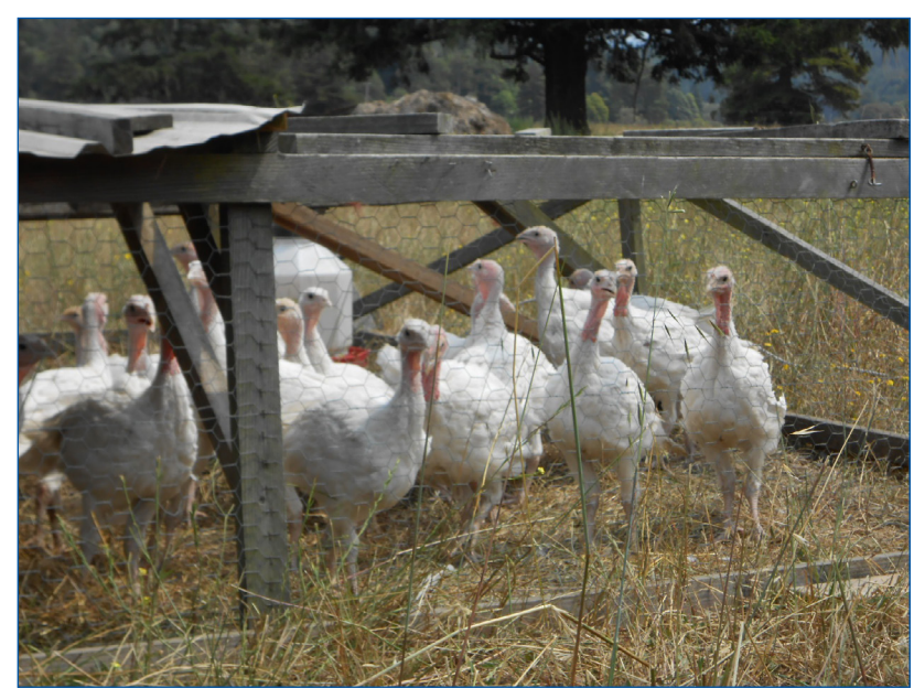
Turkeys on pasture.

• Labels must be part of the producer's OSP, approved by the certifier, and compliant with government regulations for labeling of meat (e.g. inspection or exemption, and safe food handling instructions) and eggs ("Sell by...[30 days from pack date]", Julian date, keep refrigerated, etc.). See the ATTRA publication entitled Small-Scale Egg Handling for further details.