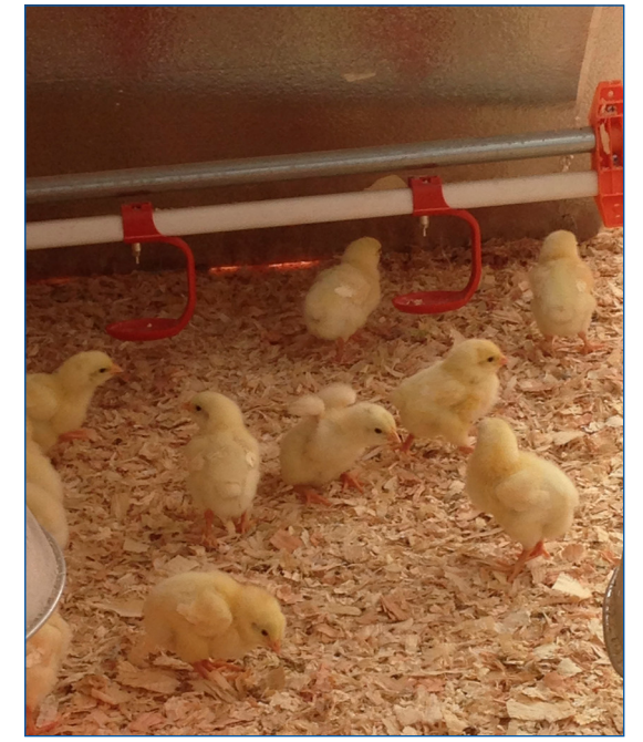
A clean environment for young birds, along with selection of well-adapted poultry breeds, are foundations of preventative health care for organic poultry.

Although pasture is not required for organic poultry, outdoor access is required. Production systems that allow poultry to forage fulfill the