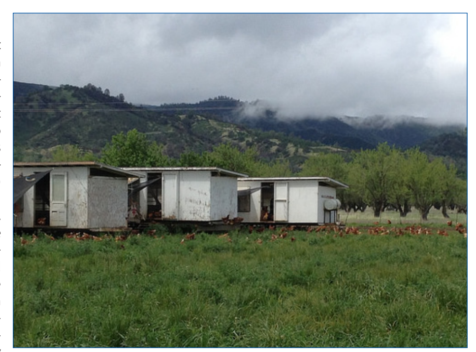
Outdoor access is required by organic regulations for all livestock. Access to pasture, although not specifically required for organic poultry, allows birds to actively forage for plants, bugs, and seeds, and generally results in better health.

This tipsheet discusses certified organic poultry production for eggs and meat in compliance with United States Department of Agriculture (USDA) organic regulations. The costs of meeting organic production regulations are related to the cost of organic feed (which varies widely depending on access and proximity to production of organic grains) and housing and management (which vary with weather and system design). Some markets and consumers value organically raised livestock and livestock products, both in terms of food value and benefits to animal welfare and environmental stewardship. In these markets, organic products command price premiums, which may offset higher production costs sufficiently for organic poultry production to be a viable business.