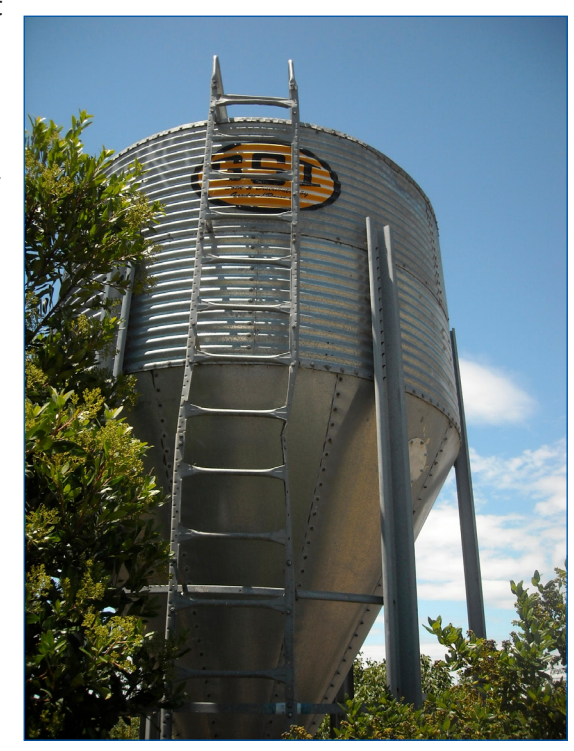
Organic poultry must be provided with rations that are 100% organic and allowed ingredients for good nutrition and productivity. A grain silo is one way to protect feed from the elements and pests.

requirement for outdoor access and can provide for healthy living conditions. Pasture-based systems can be certified organic when they use organic feed, preventative health care, and avoid prohibited materials. House-based systems are also permitted for organic production, provided they allow for access to the outdoors and direct sunlight, and otherwise fulfill all other regulatory requirements described below in Living Conditions.