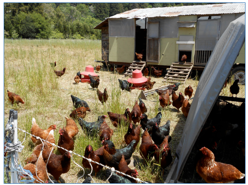
Living conditions required by organic regulations include access to the outdoors, shade, shelter, exercise areas, fresh air, clean water for drinking, and direct sunlight, as shown at Everett Family Farm.

Chicks, poults, and other young birds are typically confined during brooding to keep them warm and safe from predators. Outdoor access is required for all poultry once they have adequate feathering. Confinement of poultry after this stage of development—about four weeks for chickens—must be documented and justified according to the reasons for temporary confinement allowed in §205.239: inclement weather; stage of life; health, safety, or well-being; risk to soil or water quality; healthcare—illness or injury; sorting, shipping or sale; breeding; and youth projects.