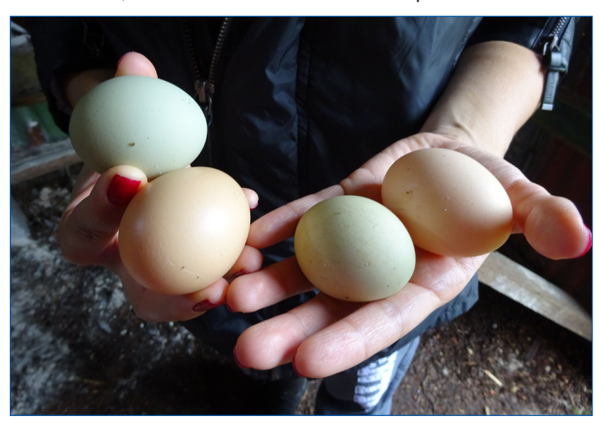
Freshly gathered eggs. Eggshell colors are characteristic of different breeds of laying hens.

In order to sell eggs as organic, they must be handled in certified organic handling facilities and using allowed materials. Materials commonly used in egg handling include cleaners, sanitizers, and egg-coating materials. These are listed in §205.605(a) and (b) with any restrictions on their use as sanitizers (chlorine materials, potassium hydroxide, sodium hydroxide, hydrogen peroxide, sodium carbonate, and peracetic or peroxyacetic acid); defoaming agents (ingredients must be organic or on the National List, i.e., silicon dioxide, lecithin, organic vegetable oil), and egg coatings (organic oils). As noted above, any material planned for use must be listed in your OSP and approved by your certifier for its intended use. In addition to being allowed under NOP organic regulations, egg handling methods and materials must meet