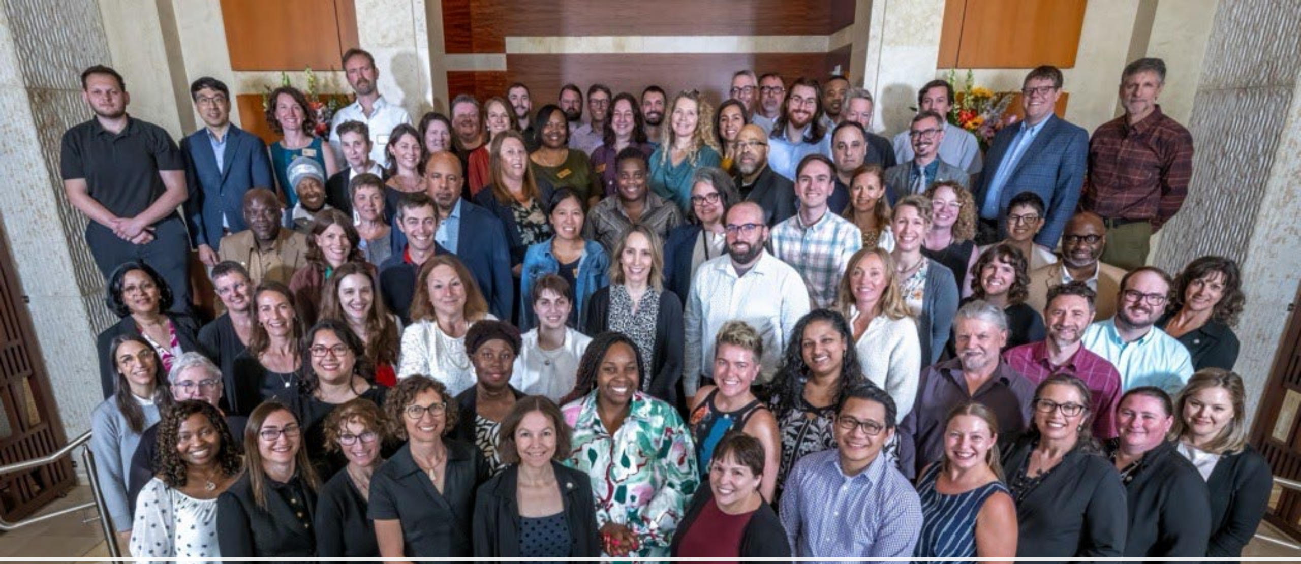
Team NOP – June 2024