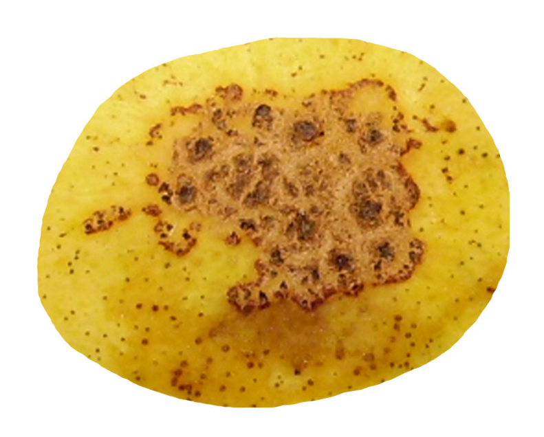
Scab on stem end of fruit.