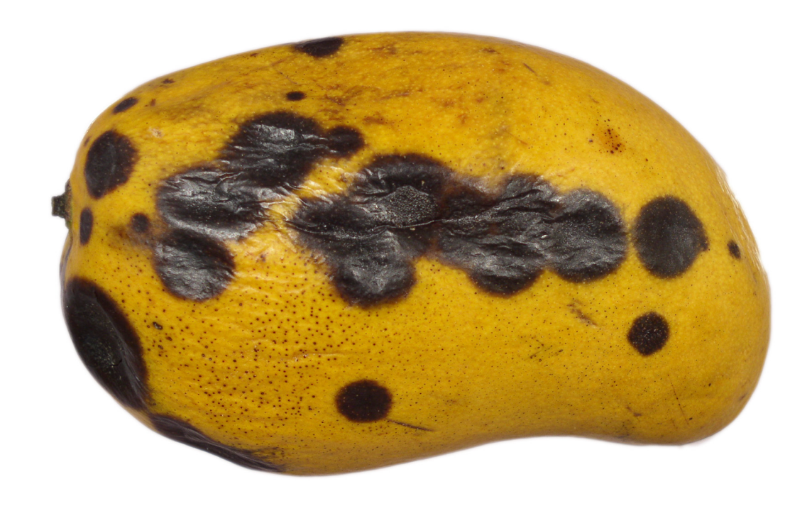
Anthracnose in advanced stages (along central portion of fruit).