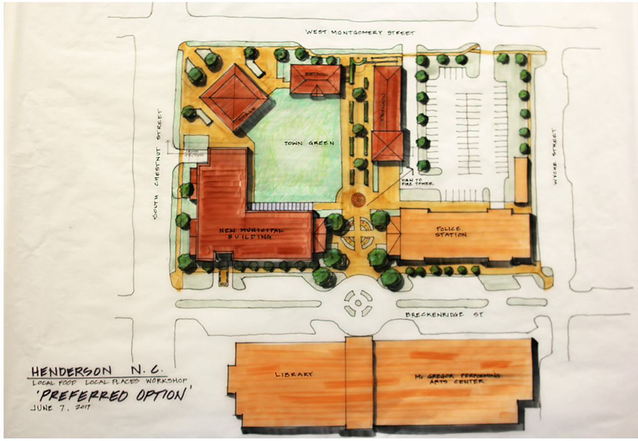
Figure 11 - Proposed site plan for the Embassy Square site

pedestrian connectivity between Breckenridge and Montgomery streets, access to the town green and pavilion, and views to the iconic clock tower. The walkway is also imagined as having space for vegetation, a water feature, and some kind of memorial or cultural icon (such as a veterans' memorial at the end of the walkway facing the library).