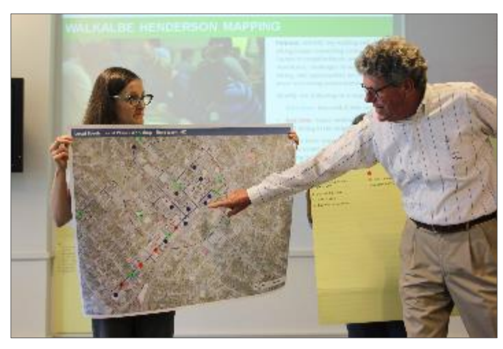
Figure 8 – A workshop participant explains the findings of the walkable Henderson mapping exercise.

In addition to developing an action plan, the technical assistance team also helped the community come up with a design vision for the last remaining vacant parcel in the Embassy Square district, which includes the existing performing arts center, the Perry Library, the police station, Breckenridge Street, and the vacant city-owned lot on the corner of Chestnut and Montgomery streets. The final design concept included a multipurpose pavilion where the downtown farmers market might be, a performance