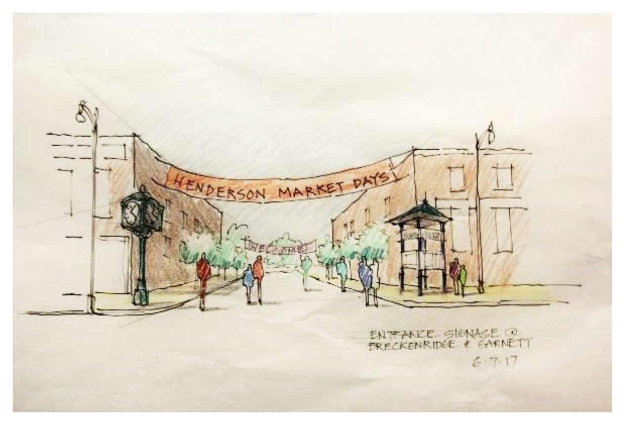
Figure 13 – Street improvement concept for the intersection of Garnett Street and Breckenridge (looking northwest down Breckenridge)

A main focus of the workshop was improving overall pedestrian connectivity in downtown Henderson, and making Embassy Square a vibrant destination and hub of activity. In addition to a conceptual site plan for the Embassy Square district, the technical assistance team designers produced a conceptual sketch of the entrance to Breckenridge Street (Figure 13). The design visualizes how low-cost improvements such as signage and iconography could help to draw people down Breckenridge Street from Garnett Street and into the civic space and farmers market at Embassy Square. Figure 13 shows banners that read "Henderson Market Days" and "Welcome" placed progressively down the street. It also shows a clock and information booth, modelled on the iconic fire station clock tower, that help frame the entrance to the street. They serve an aesthetic function in line with Henderson's historic and architectural context.