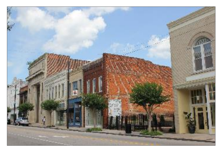
Figure 4 – Downtown Henderson.

In preparation for Local Foods, Local Places technical assistance, the Henderson-Vance Downtown