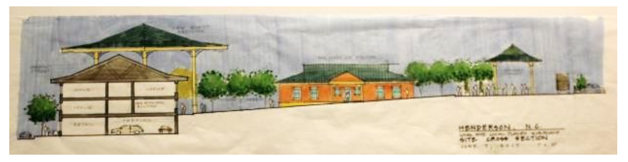
Figure 12 - Cross Section of the Site Plan for Embassy Square