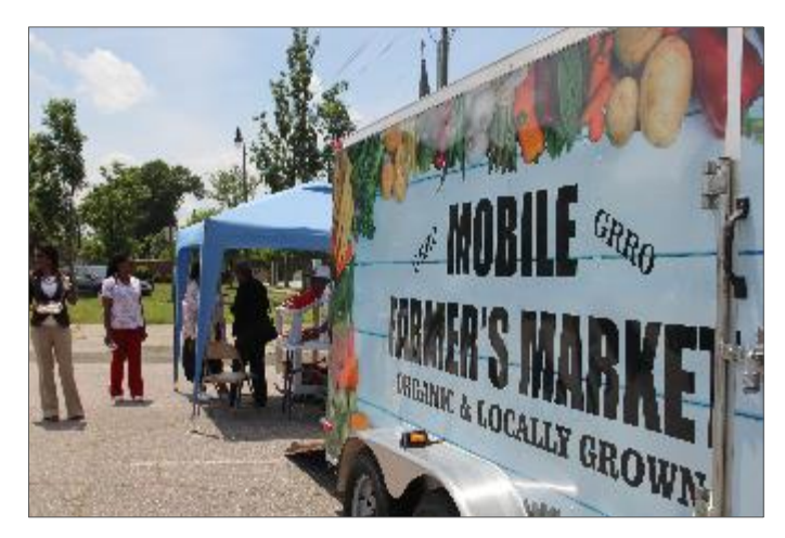
Figure 2 – The Green Rural Redevelopment Organization (GRRO) Mobile Market.

Several organizations and institutions in Henderson are responding to the economic conditions and health challenges by increasing access to fresh and healthy foods, and making local foods part of the community's economic and community development strategy. They recognize that the popularity of local foods can be used to attract more people and businesses into the city's downtown. Some of the key partners in this endeavor include the Green Rural Development Organization (GRRO), The North Carolina Cooperative Extension, the Conservation Fund, the Vance County Regional Farmers Market, and faith groups including Area Christians Together on Service (ACTS).