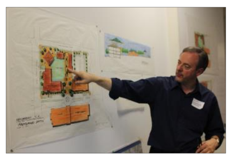
Figure 9 – A member of the technical assistance team presents the community design vision.

or music stage, open green space, restrooms, mixed use office and retail (private and municipal), and branding and iconography that represents Henderson's identify and history. Figure 9 shows a designer presenting the concept to workshop participants. A full explanation of the design concept is available below.