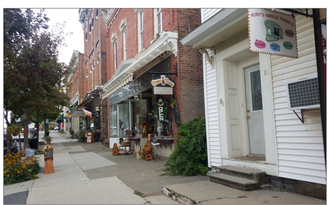
Natural resources have long fueled the local economy. Early settlers were attracted to the

Located among rolling green hills and farmland in Washington County and just south of the Adirondack Mountains is the picturesque village of Greenwich, New York. It is located on the Battenkill River in the Towns of Greenwich and Easton. The village has a rich history, having served as an important station on the Underground Railroad, with local citizens helping enslaved people reach freedom in upstate New York or Canada.