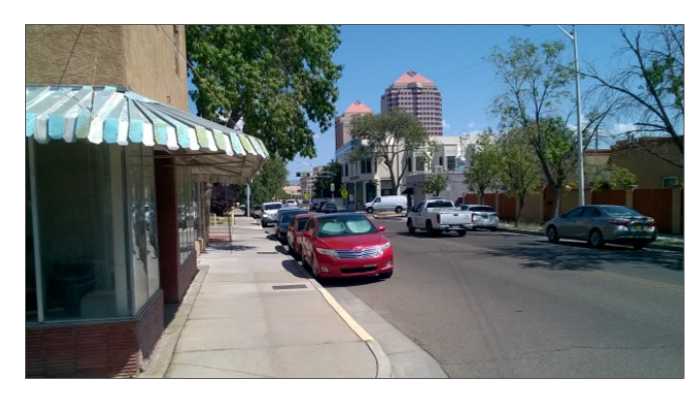
Figure 1 – Streetscape in Albuquerque with the downtown core in the distance

Albuquerque is a diverse city—almost half of all residents are of Hispanic or Latino origin, and 20 percent of residents speak at least two languages. Downtown Albuquerque, about a 30-block area, was once the vital center of this southwest U.S. city. Decades of disinvestment stemming from a variety of factors, including mid-century federal urban