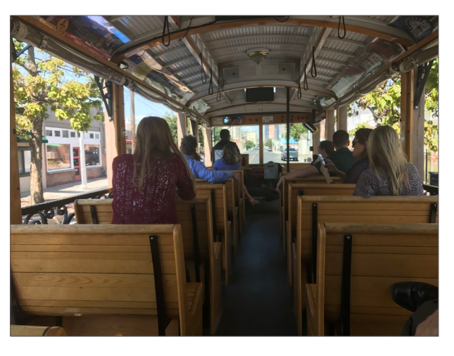
Figure 6 Trolley tour underway in Downtown Albuquerque.

The Local Foods, Local Places steering committee organized a luncheon on September 11, 2017 with key stakeholders at MAYA Cuisine to introduce the project to the technical assistance team consisting of consultants and federal agency representatives. Following the luncheon, the steering committee led a tour of key places and projects in downtown Albuquerque and its surrounding residential neighborhoods via trolley, including the proposed new location for Three Sisters Kitchen, the current Three Sisters Kitchen, the adjacent transportation center, The Railyards, new residential and affordable housing developments, the new conventional grocery store, the Downtown