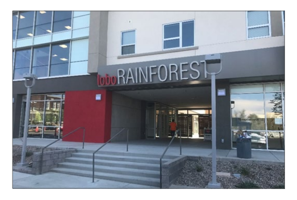
Figure 2 – Lobo Rainforest, one of the new buildings in Innovation Central ABQ

entertainment district called One Central are evidence of the revitalization of downtown. Increasing access to fresh, healthy food is another initiative that is being addressed from a variety of angles—from public investment to new non-profit enterprises. Another significant investment is the Albuquerque Rapid Transit along Central Avenue starting at Coors Boulevard on the west side through downtown Nob Hill and east to Louisiana Boulevard in the International District. It is currently under construction but plans to open in 2018. There is a newly opened conventional grocery store in the neighborhood in an area that hasn't had a grocery store in several decades. However, the Downtown Growers' Market has been active for two decades and