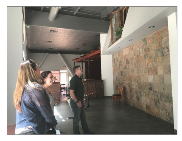
Figure 3 – Team members looking at the future Three Sisters Kitchen space pre-renovation

Three Sisters Kitchen is one of downtown Albuquerque's newest homegrown, healthy food start-ups. The aim of Three Sisters Kitchen is to "make fresh, local food accessible, affordable, and fun to cook, and create pathways for food entrepreneurs to experiment and build businesses that succeed, contributing to a healthier and more vibrant Albuquerque." Currently, Three Sisters Kitchen hosts community food and cooking events downtown.