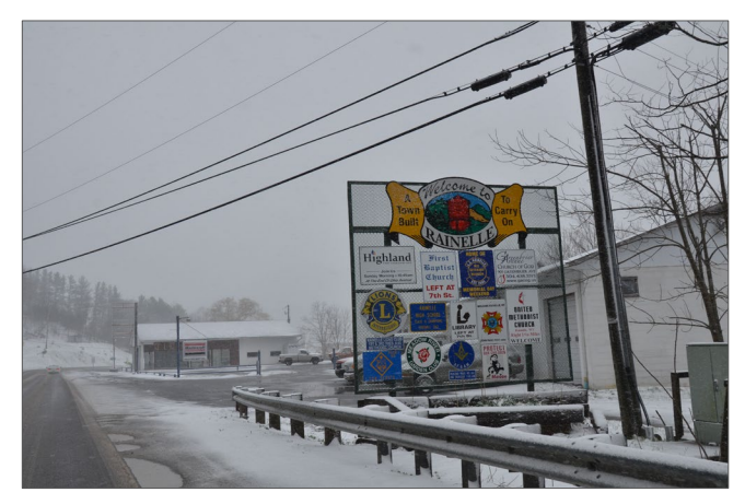
Figure 1 – Gateway to Rainelle.

Rainelle is small city of about 1,500 people in Greenbrier County, West Virginia. Totaling just over one square mile, its western city limit is the border between Greenbrier and Fayette counties. The Meadow River flows through the city in a westerly direction on its way to joining the Gauley River. As a former sawmill town Rainelle's experience is similar to many central Appalachian communities. The Meadow River Lumber Company, which operated in Rainelle from 1906 to 1975, was once the largest hardwood sawmill in the world. The business was sold to the Georgia-Pacific Corporation in 1970, and the mill was torn down in 1975. The loss of the mill catalyzed an economic downturn