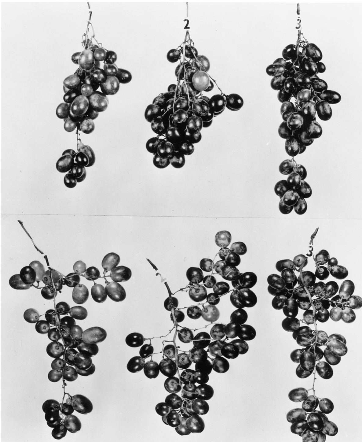
TABLE GRAPES, STRUCTURE OF BUNCHES -- EMPEROR

All bunches are straggly. Bunch No. 3 is just below the requirement for U.S. No. 1 Grade.