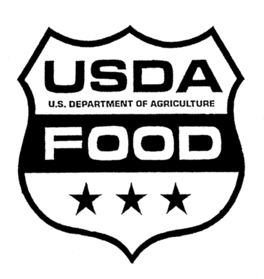
Exhibit 2 Alternative Label for Shipping Containers (Includes all Required Information)

Effective Date: April 2015 Page 15 of 20