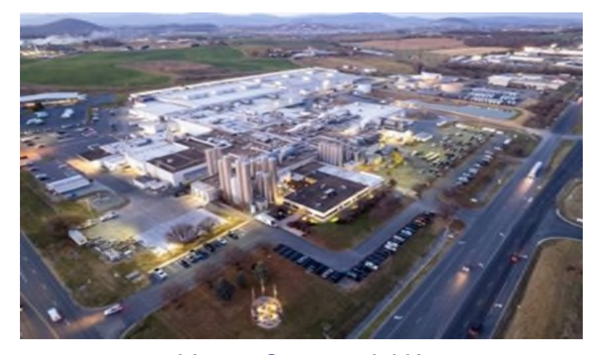
Mount Crawford, VA