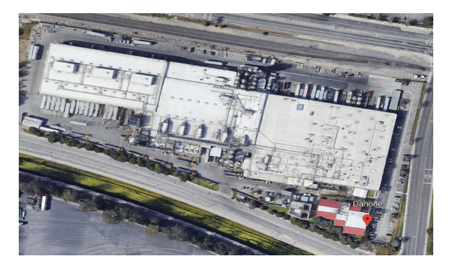
City of Industry, CA