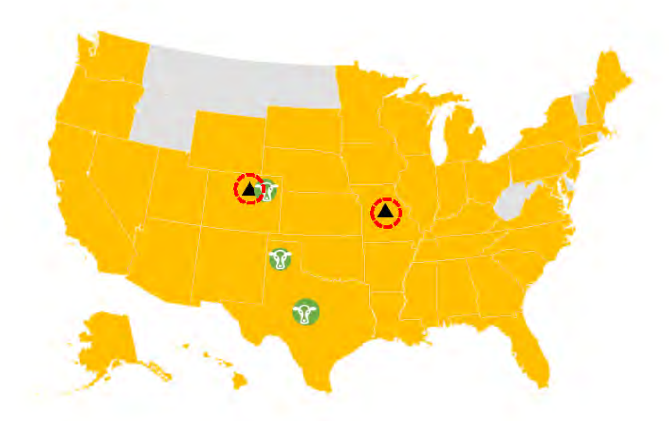
FIGURE 2 Aurora Organic Dairy Milk Production and Processing Footprint and Packaged Milk Flows, 2023

The model doesn't distinguish between organic and conventional farm milk supply and dairy product demand. Thus, the model's assumed movements of farm milk supply and packaged fluid milk demand for Aurora's plants in Colorado and Missouri are not accurate whatsoever. While I don't expect any model to be perfectly accurate, the model's results for Aurora's areas are not even close to our operational reality. I expect this divergence happens across the country for other organic milk systems as well. This divergence between reality and the model is different from the issues raised by NMPF that the differentials reflect "business relationships." The problem here is not that Aurora has business relationships, but that there are USDA regulations that only permit certain raw milk (USDA certified organic) to be used in organic milk products. It is not