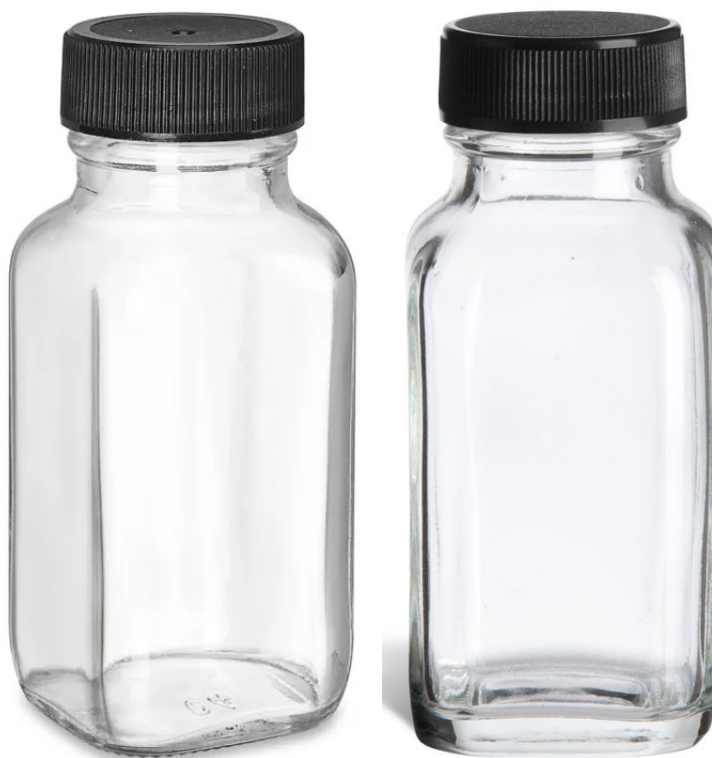
FIGURE 1.1 – 2-OUNCE GLASS BOTTLES EXAMPLE

Field Offices and Agencies will retain and properly maintain type samples in suitable clear glass or clear plastic bottles (approximately 2-ounce capacity).