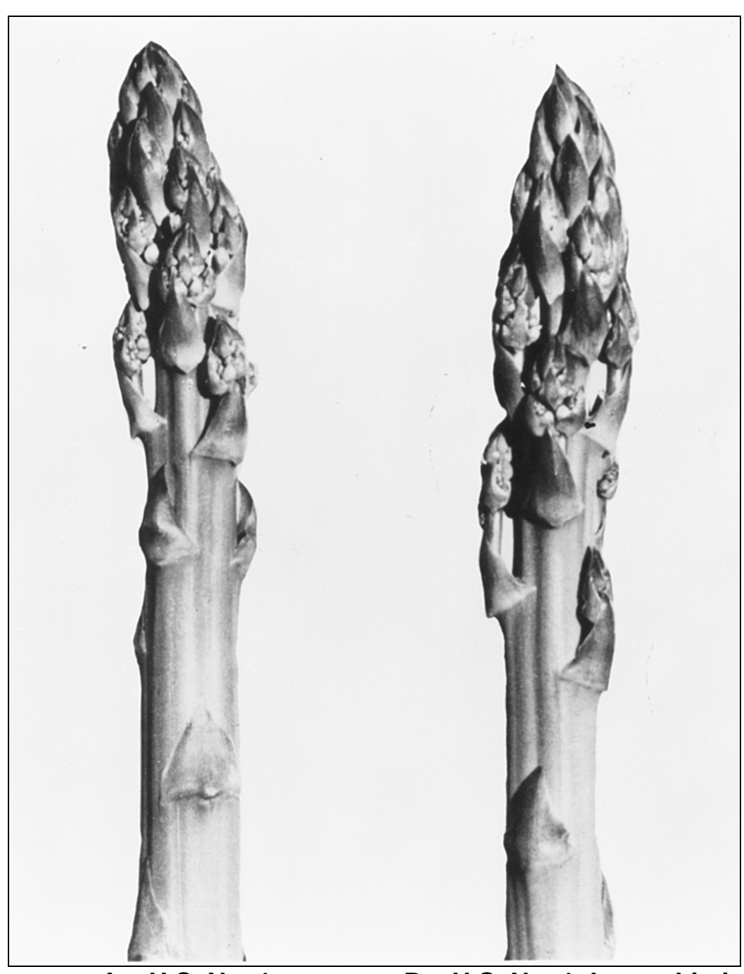
A – U.S. No. 1