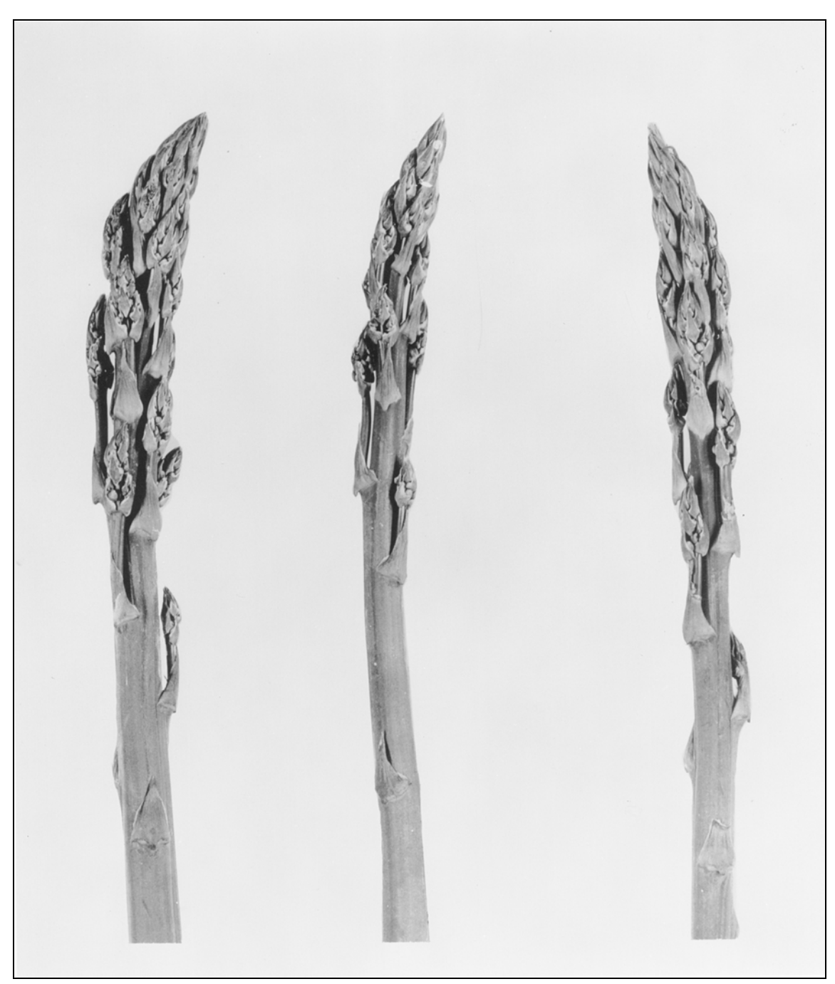
U.S. No. 2 – Lower Limit. Damaged By Spreading, But Not Seriously Damaged.

Asparagus, Photo No. 13 February 1991 (Previously No. 13, no date)