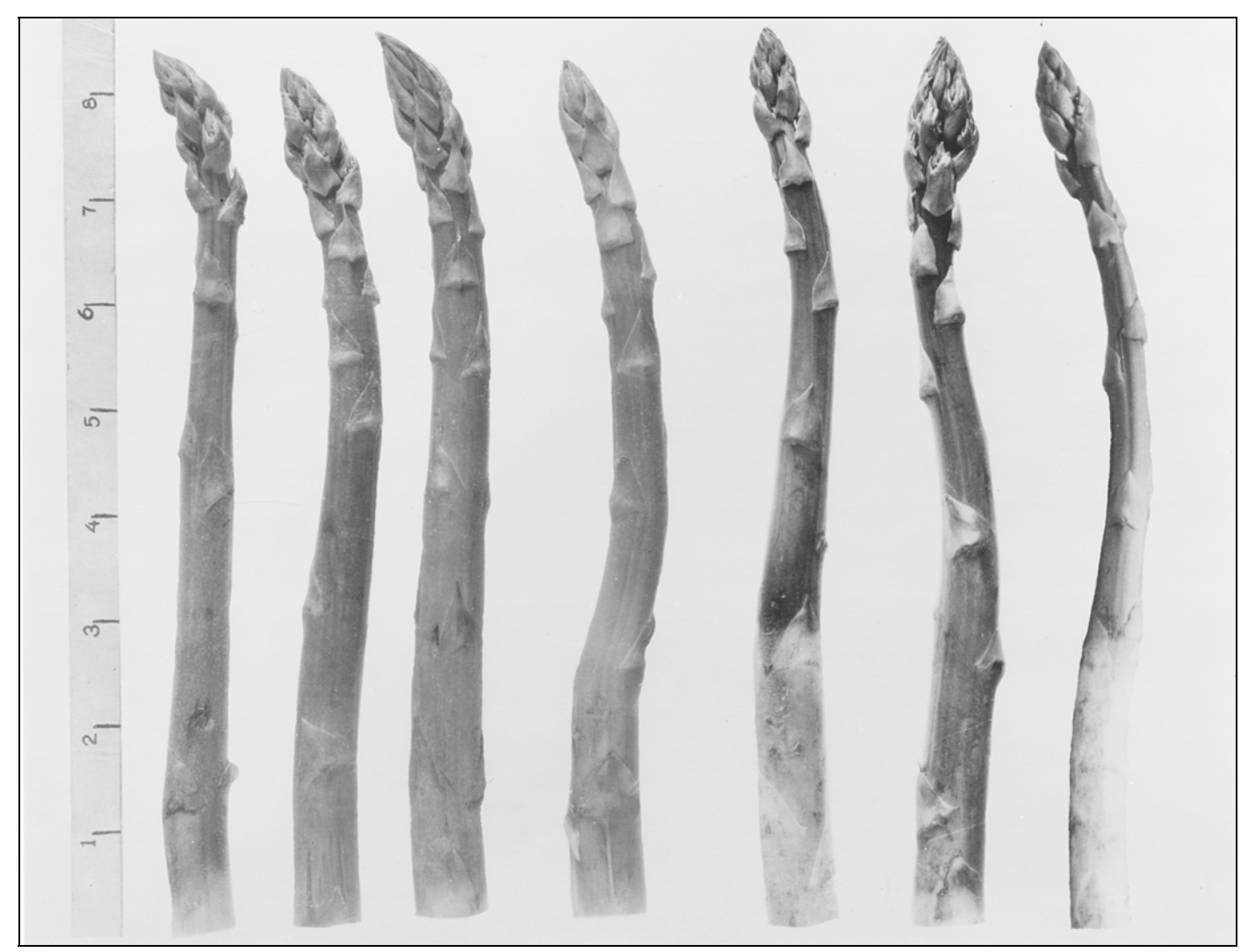
Fairly Straight Asparagus Stalks. Permitted in U.S. No. 1.

Asparagus, Photo No. 10 November 1994 (Previously No. 10, no date)