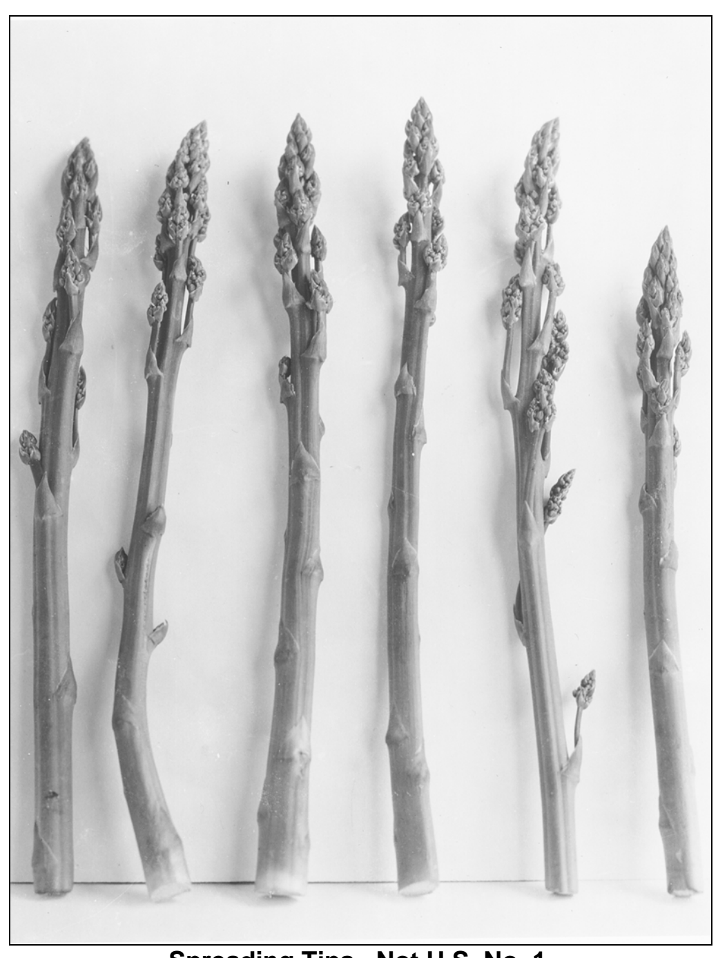
Spreading Tips. Not U.S. No. 1.

Asparagus, Photo No. 7 November 1994 (Previously No. 7, no date)