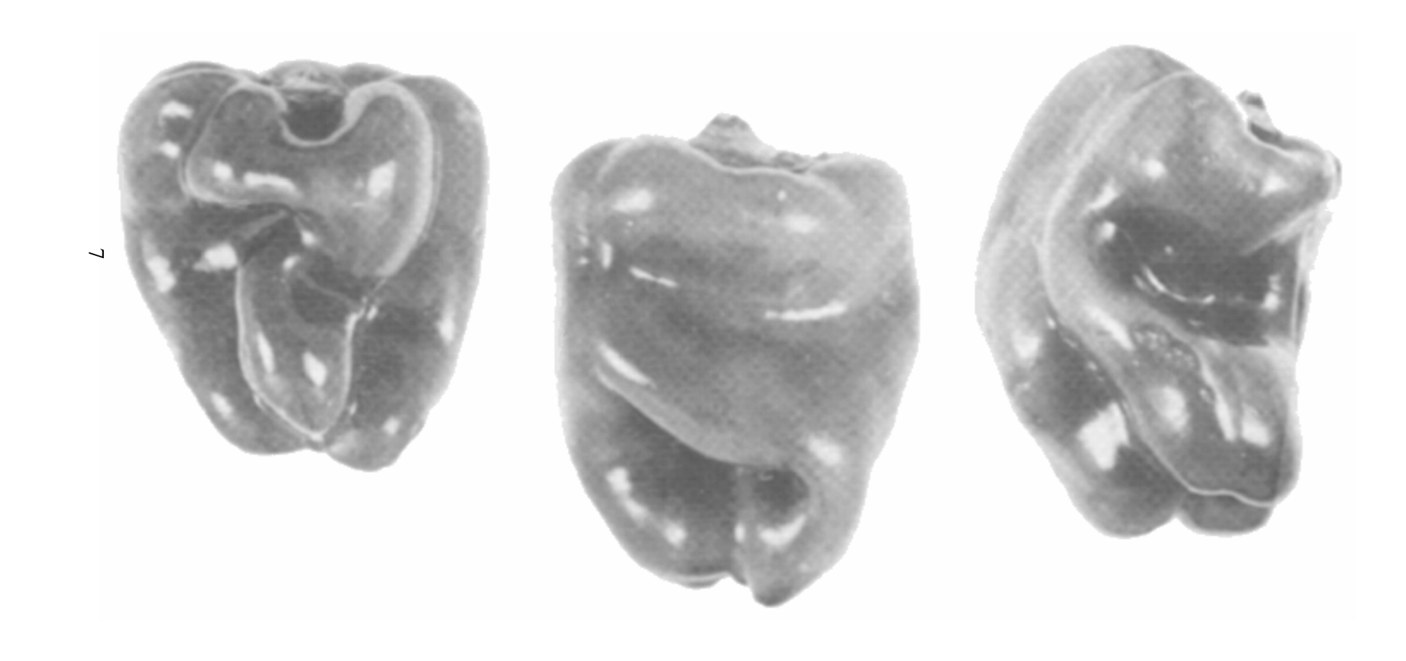
Illustration PEP 3