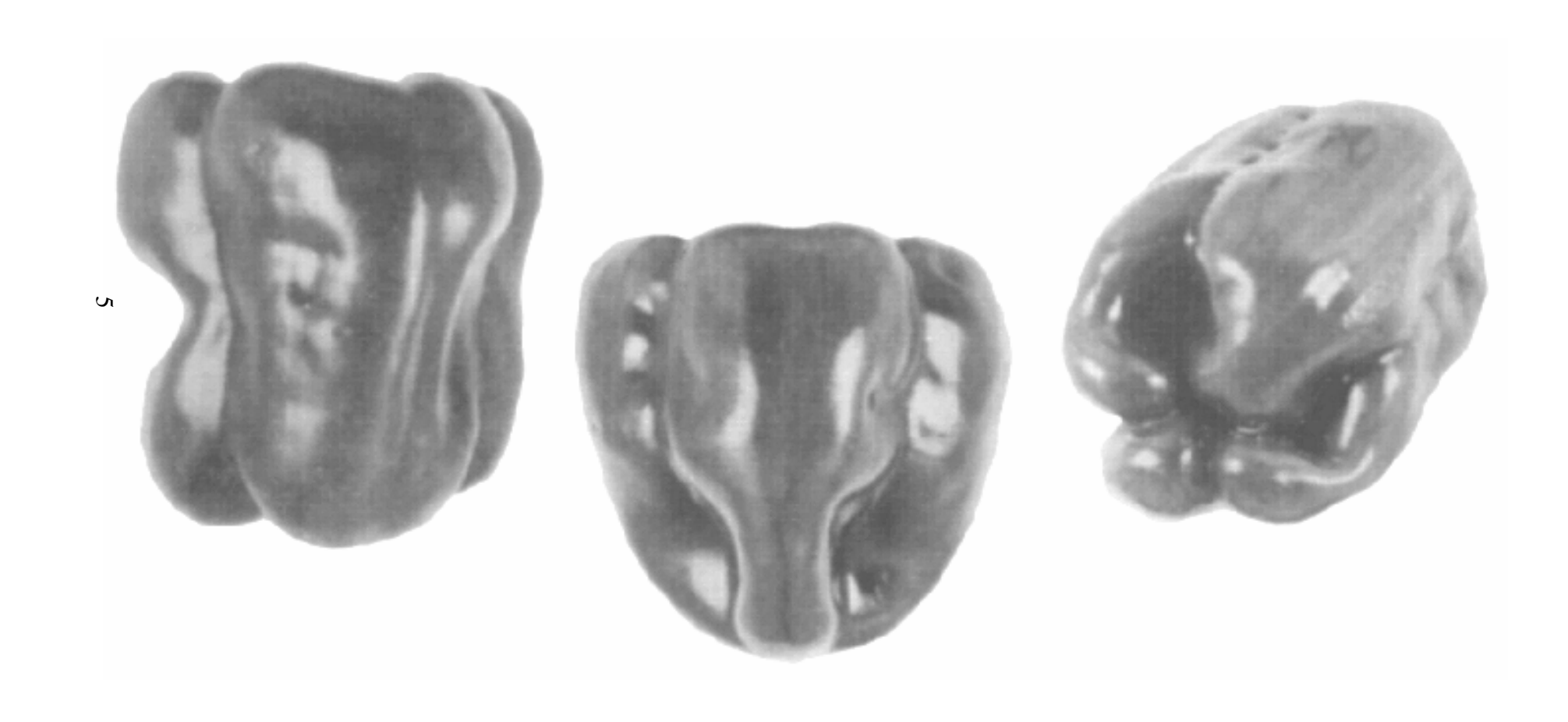
Illustration PEP 1