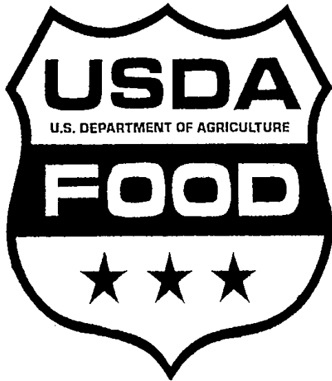
Exhibit 3 – Sample Alternative Label for Shipping Containers